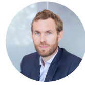
Benjamin Raigneau Head of Sanitation and Water Department, City of Paris